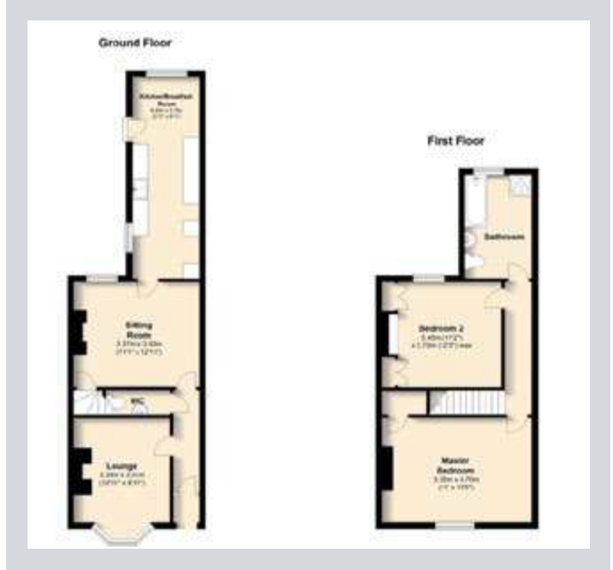
Figure 5: The floorplan for an 89m2 property with a SAP modelled occupancy of 2.3 \,

This is a two-bedroom end-terrace with a total floor area of 89 m2. Therefore, the assumed number of occupants by the SAP methodology is approximately 2 (actually it is 2.3). In fact, there is only 1 occupant, meaning the estimated energy costs on the EPC is likely to be higher than the actual bills paid.